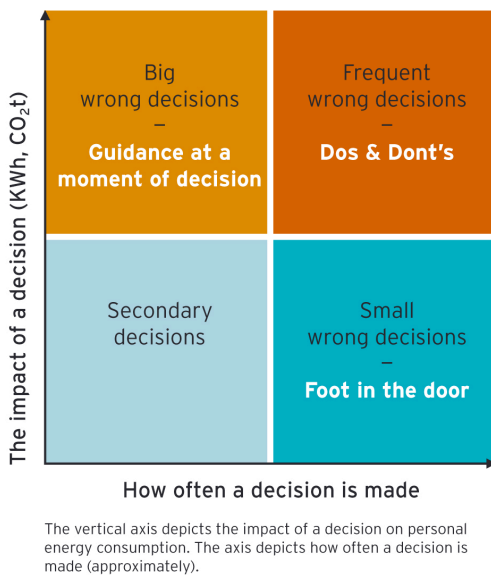
Figure 2. Fourfold table of energy-related decisions divided by the impact and frequency of the decisions.

We call the first group secondary decisions , the choices that are made rarely and have very little significance in energy use.